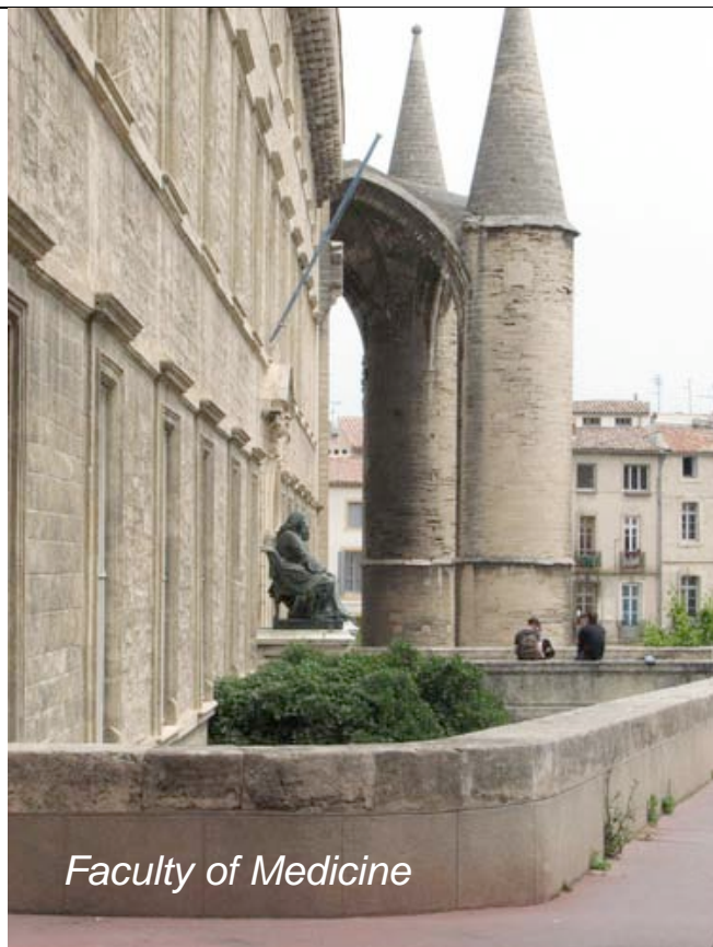
Faculty of Medicine