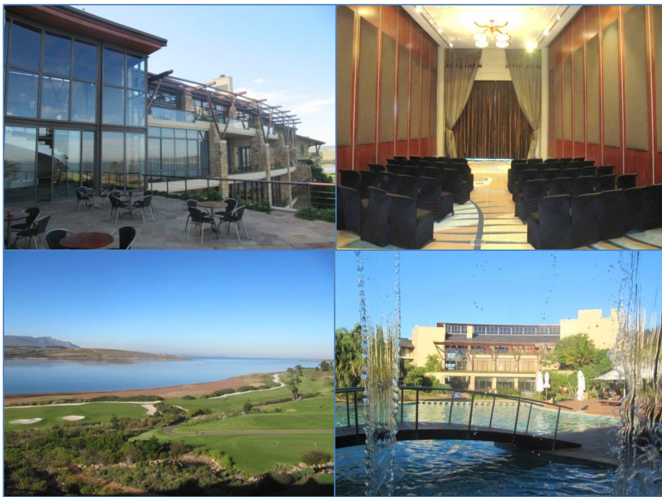
Arabella Hotel & Spa offers all the luxuries of a world class venue, excellent facilities, especially for congresses, pristine grounds, swimming pool, spa-facilities, gym, mountain views or lagoon waters, fine dining and an opportunity to savour some of the best wines South Africa has to offer. The immediate environs of the estate you're spoilt for choice with activities, such as kayaking at sea, shark-cage diving, whale watching (at certain times of the year), horseback rides through the shore, scenic hiking trails, and golf at the prestigious Arabella Golf Course, to name a few.

The congress is purposefully placed as a pre-conference satellite meeting to the World Congress of Pharmacology 2014 (WCP2014) in Cape Town. The ISSR meeting will provide an ideal opportunity to network and to make contact with some of the leading minds in the field, as well as foster local (African) and international relations and collaborations. To enable this, the academic program on each day concludes with wonderful networking opportunities under relaxed conditions and entertainment, including an African marimba band that will set the scene at the opening function and a typical